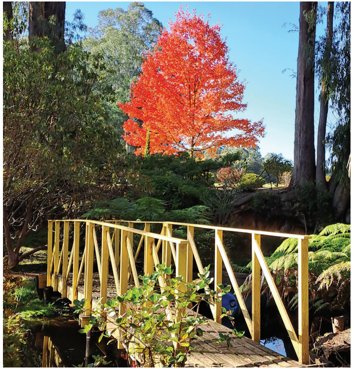
Tall Timbers, Piedmont